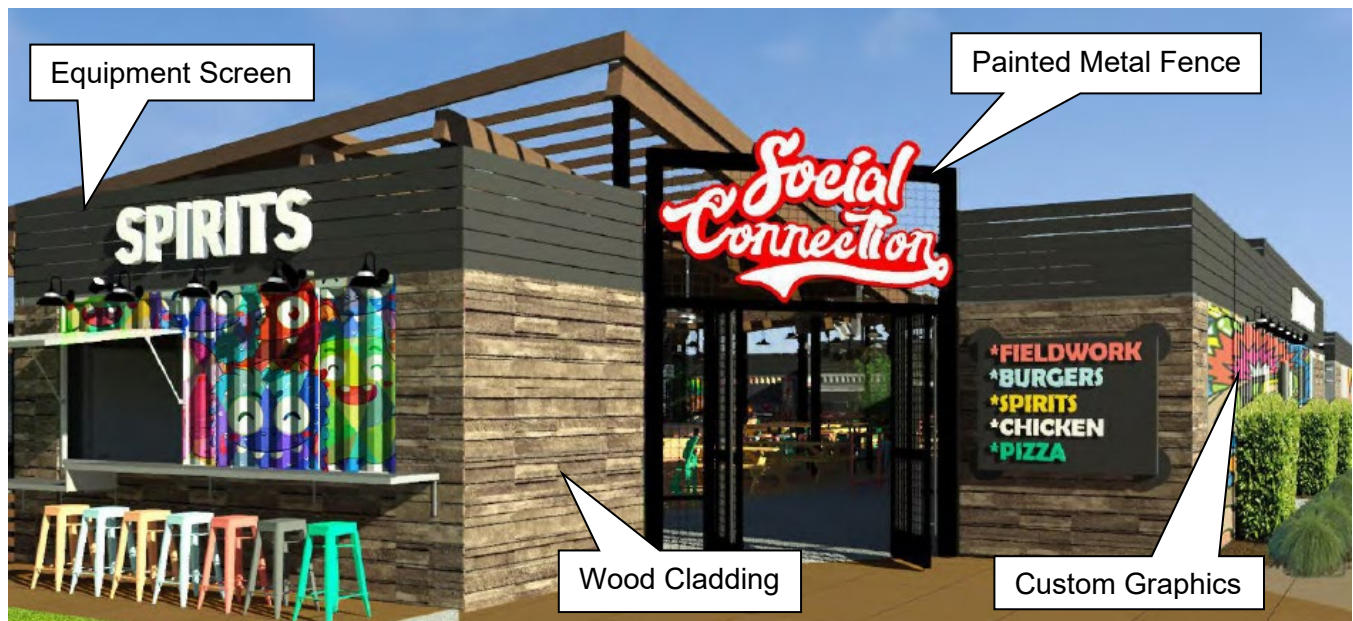
Figure 2. Typical Beer Garden Elevation (Entry 1)

In addition to the metal container and wood cladding, each structure will include a roof screen to shield the view of any mechanical equipment needed for the use. The screen will be painted black consistent with a painted metal fence that will link the container buildings and create an enclosed space. The fence will provide views into the project and visual relief from the container elevations by creating space between them. Entrance to the project will be through two gates with signage above located at the south and north of the project (Figure 3). The covered seating area will also feature black metal consistent with the fence and equipment screens.