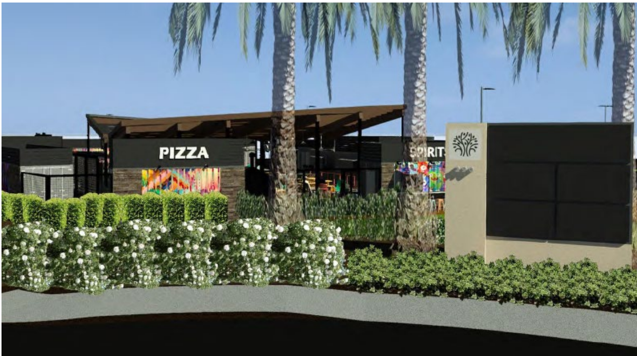
Figure 5. View from South Project Entry

MPP Stage 2 Summary: Section 19.82.03.C.2 of the City of Roseville Zoning Ordinance requires that two findings be made to approve a MPP Stage 2. The two findings for approval are contained in the Recommendation section of this report. In summary, staff finds that the architecture and landscape plans for the Roseville Junction Beer Garden are consistent with the NCRSP Design Guidelines, Roseville Junction Design Guidelines and the CDG's and will not be detrimental to the public health and safety or welfare, as described in detail above. As proposed and conditioned, the project complies with the required findings for approval. For these reasons, staff recommends approval of the MPP Stage 2 request.