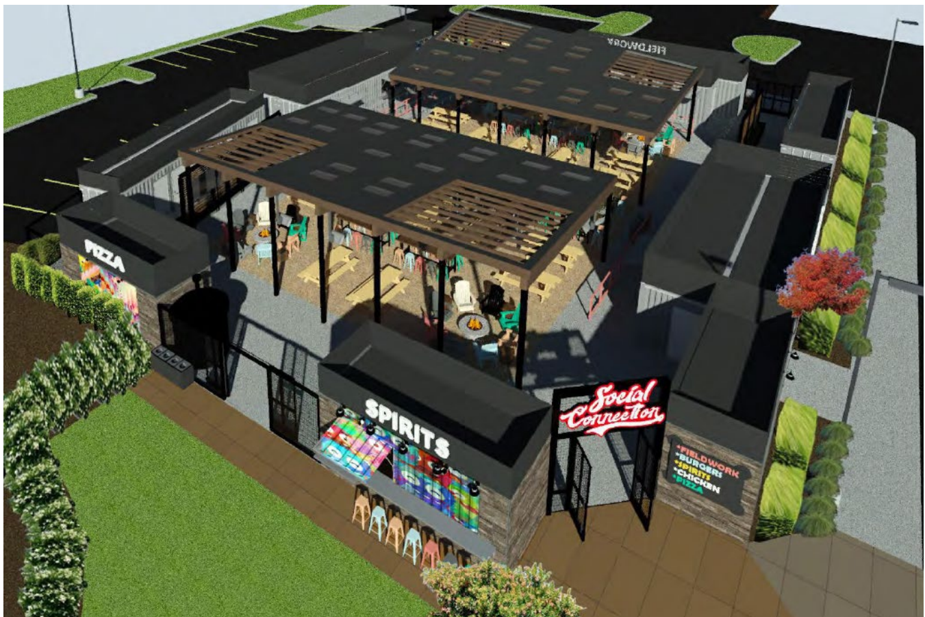
Figure 3. Proposed View from Southeast (Entry 1)

Landscaping: A preliminary landscape plan was approved as part of the MPP Stage 1 and included within the Roseville Junction Design Guidelines. Consistent with that approval, and the approved footprints for the buildings, the project developer submitted improvement constructions plans for the drive aisles, walkways, and landscape surrounding the future beer garden project. Therefore, the landscape associated with the current Major Project Permit Stage 2 submittal is just for those limited plantings located within the boundaries of the beer garden. Figure 4 is provided for reference to show what plantings and walkways will be located surrounding the project.